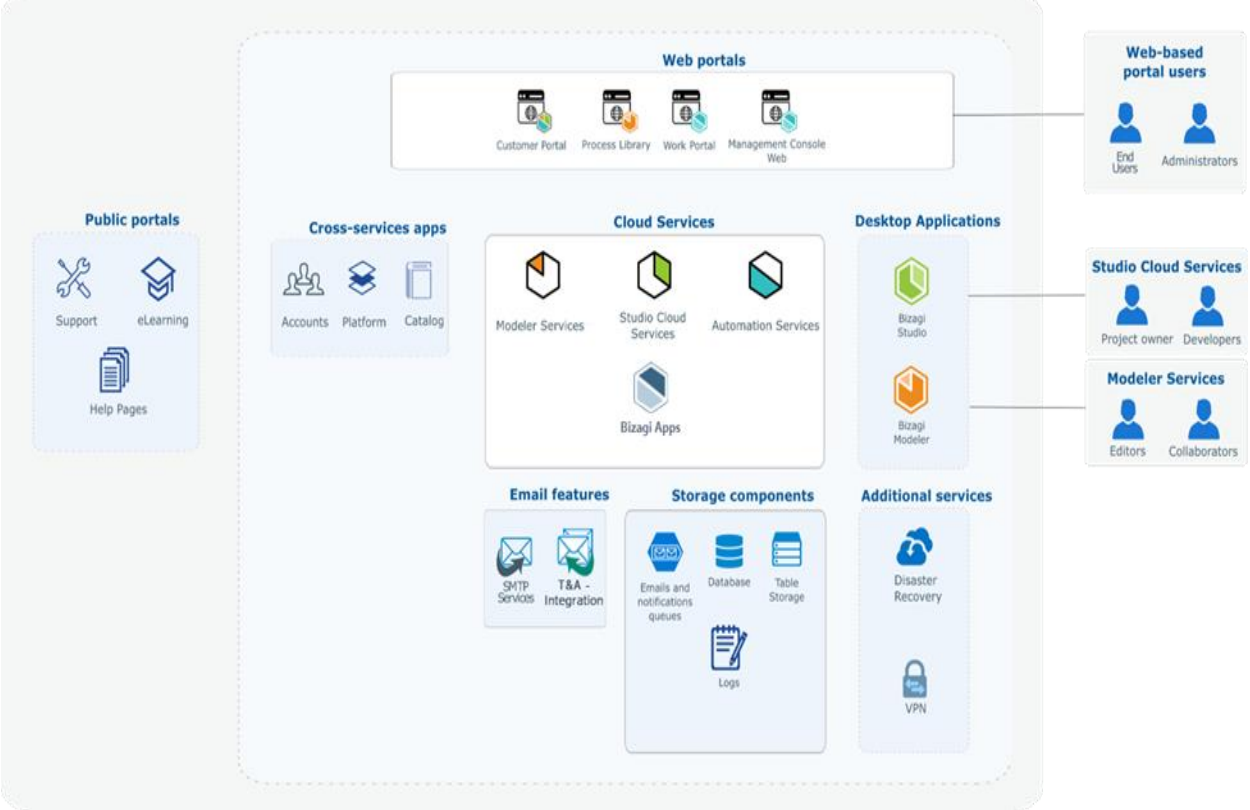
Figure 1 Services included in the platform.